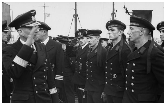
Uniforms of the Kriegsmarine

When U-boats put to sea, there were few restrictions on what personnel wore. Full uniforms were typically worn on departure from and return to base. Due to the cramped and humid conditions, U-boat crews often began wearing more comfortable light civilian clothing after they set sail. These included seaman's jumpers and sleeveless shirts. Lookouts would still wear ponchos and sou'westers when on duty. German U-Boat crews were also commonly issued with British Army Battle Dress (with German insignia added). [14] Large stockpiles had been captured by the Germans after the fall of France in 1940.