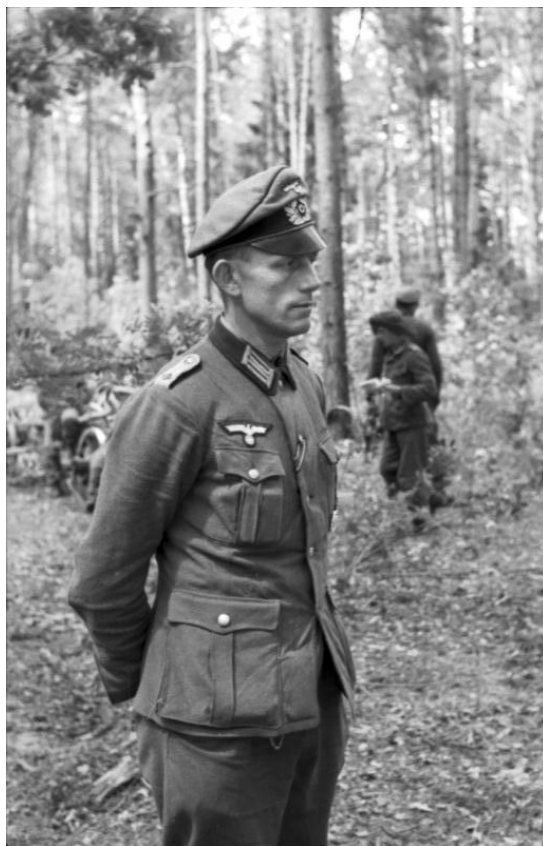
Oberleutnant on the Eastern Front wears a Schirmmütze without the wire stiffener. This gave it a resemblance to the old style “crusher” cap.