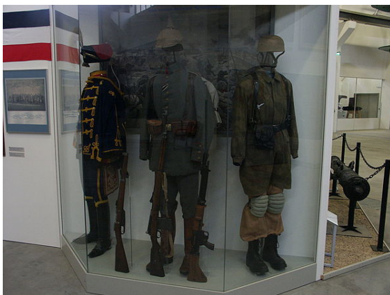
Paratrooper's knochensack worn over the standard Luftwaffe jumpsuit (right)

The following is a general overview of the Wehrmacht main uniforms , though there were so many specialist uniforms and variations that not all (such as camouflage, Luftwaffe , tropical, extreme winter) can be included. SS