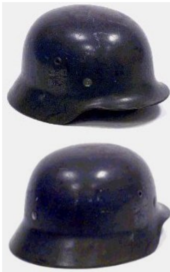
World War II Stahlhelm

Officers and NCOs in the field would sometimes remove the wire stiffener from the Schirmmütze to achieve the “crush” look, especially tank crewmen (to facilitate wearing headphones); this unauthorized but widespread practice should not be confused with the true “crusher.”