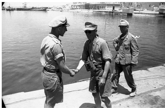
Afrika Korps at Tobruk