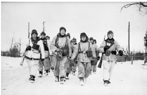
Winter uniform in January 1944