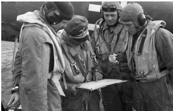
German pilots in France, 1942

Main article: Uniforms and insignia of the Luftwaffe The basic uniform of the Luftwaffe consisted of a