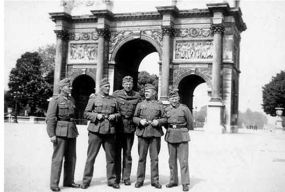
Germans in Paris, 1940

SS field uniforms were of similar appearance externally but to fit their larger patches had a wider, feldgrau collar, and the lower pockets were of an angled slash type similar to the black or grey SS service-dress. The second button of an SS Feldbluse was positioned somewhat lower, so that it could be worn open-collar with a necktie. Due to supply problems the SS were often issued army uniforms.