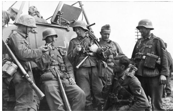
German soldiers with Stahlhelms in the Soviet Union in 1942

M40 Tunic The M40 uniform was the first design change in the standard army uniform. It differed from the M36 only in the substitution of feldgrau for the bottle green collar and shoulder straps, which began to be phased out in 1938/39, though most combat examples show this variation appearing in 1940, hence the unofficial M40 pattern. The troops liked the older green collars, and M40 (and later) tunics modified with salvaged M36 collars or bottle-green collar overlays are not uncommon.