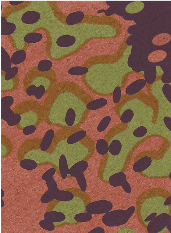
Platanenmuster ( Plane tree pattern )

the Luftwaffe to the knochensack jump smocks of the Fallschirmjäger , and fashioned into camouflage smocks for the infantry, while Platanenmuster was worn by snipers, panzer crews and the Waffen-SS . Flecktarn , an updated version of the earlier plane tree pattern, is still used by the modern German Bundeswehr . [11]