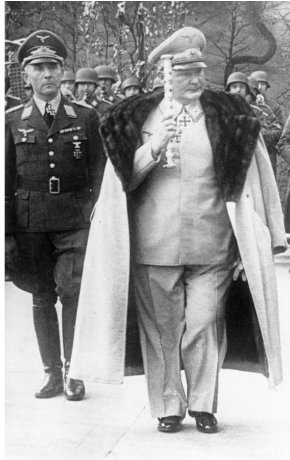
Reichsmarschall Hermann Göring and Luftwaffe Generalmajor Paul Conrath

blue-grey, single-breasted, open-collared jacket with four pockets and flaps; white shirt and black necktie; blue-grey trousers; black leather boots; and a blue-grey peaked cap, side cap or Model 1935 Stahlhelm . Ranks were indicated by collar patches, along with Army-style shoulder boards.