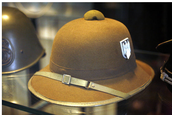
German pith helmet in olive drab