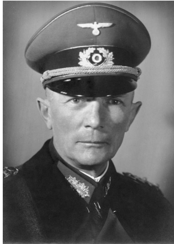
Field Marshal Fedor von Bock wearing the Schirmmütze

Peaked cap ( Schirmmütze ) The dress, service and walking-out cap for all ranks [4] was the peaked cap as finalized in 1934. The semi-rigid band was covered in bottle-green fabric, and the stiff visor came in variety of materials and were made of either black vulcanized fiber, fibre, plastic or (occasionally) [patent leather]]. The oval wool crown was stiffened with wire into a curved “saddle-