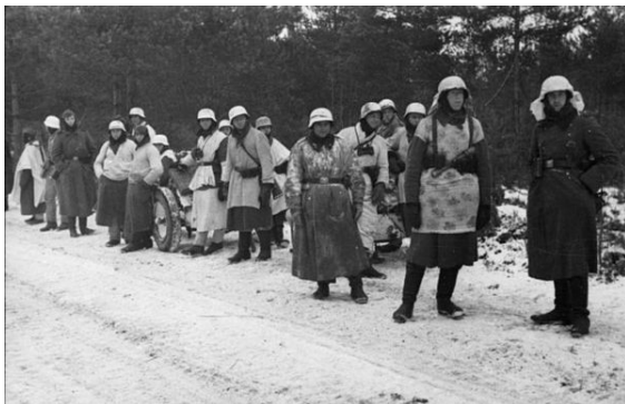
early improvised Winter camouflage in October 1941