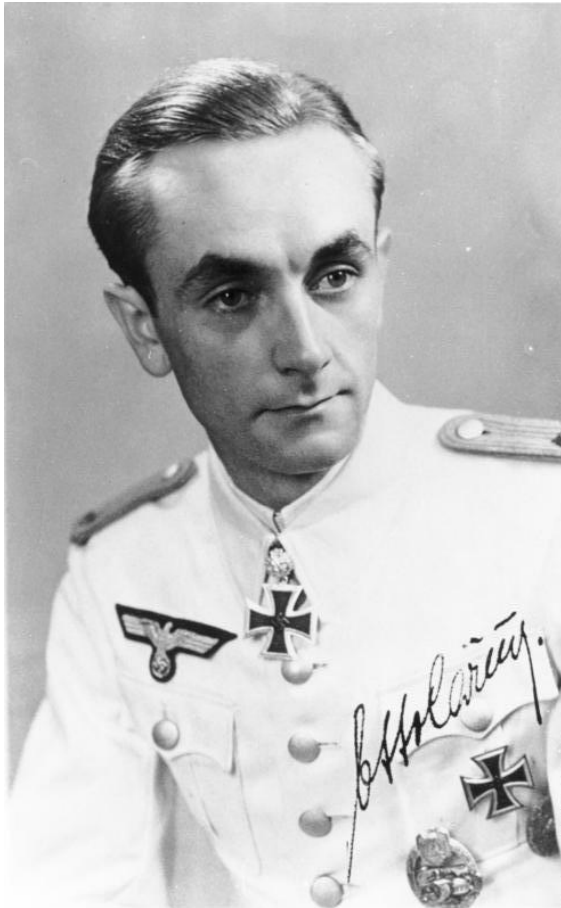
Oberleutnant Otto Carius in the summer white tunic (neue Art) [7]

Self-propelled anti-tank artillery ( Panzerjäger ) and assault-gun ( Sturmgeschütz ) crews were issued similar uniforms in field-grey from 1940.