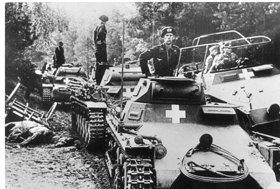
Panzercommandant wearing a beret

mained in service with the postwar German army.