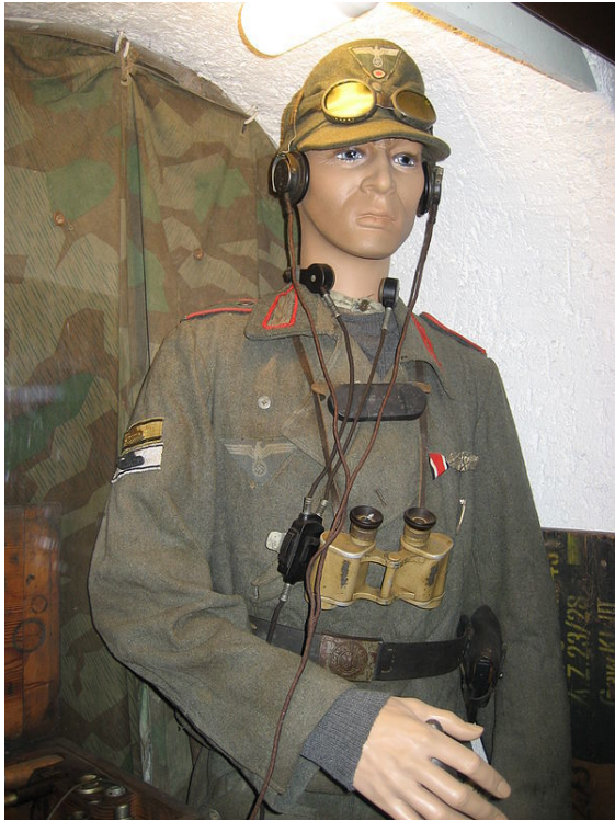
Uniform of assault gun crew

front and in field grey for mountain troops. In addition to the standard issue snow camouflage the Germans made extensive use of captured Red Army equipment, especially the boots which provided better protection from the sub-zero temperatures. There are reports of Germans sawing the legs off dead Russians then heating them in ovens so they could thaw out and remove the boots. [10]