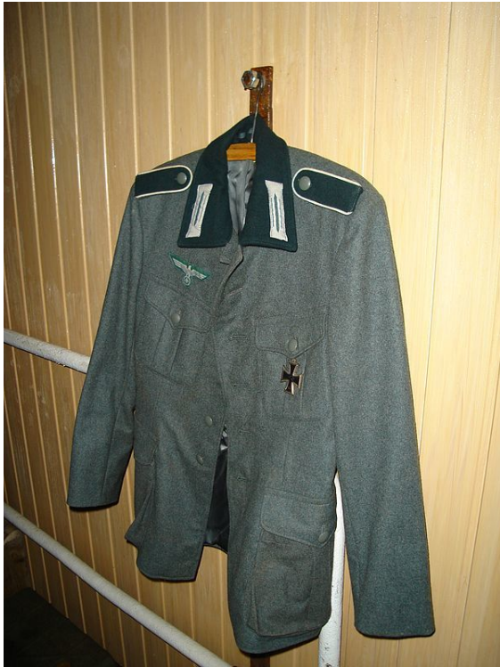
Enlisted infantryman's M36 uniform. Note the dark-green collar and shoulder-straps (with white Waffenfarbe ), the Litzen collar insignia, and the Wehrmachtssadler above the right breast pocket.