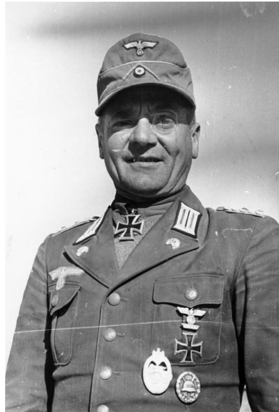
Oberst Hans Cramer wearing tropical uniform. Note the combination of green-backed M35-style collar Litzen and Panzer skulls on the lapels.