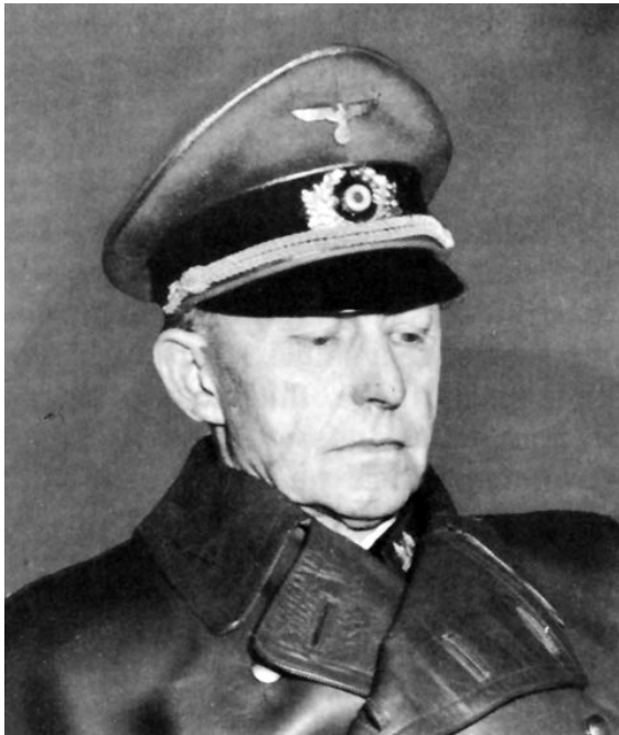
German general Alfred Jodl wearing black leather trenchcoat

This article discusses the uniforms of the World War II Wehrmacht (Army, Air Force, and Navy). For the Schutzstaffel, see Uniforms and insignia of the Schutzstaffel .