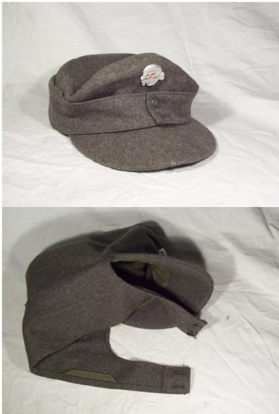
M43 field cap (SS insignia)

buttons: this was rapidly overtaken by the M43 field cap. ( Dienstanzug )