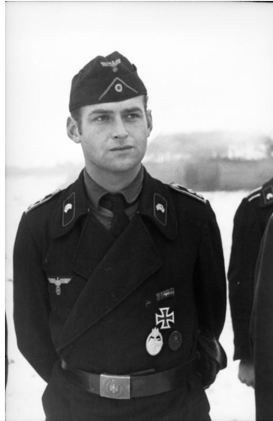
Oberfeldwebel, Panzer troops, 1941

A one-piece denim overall, known as a Panzerkombi , was issued to panzer (armoured) crews and mechanics for maintenance work and the like; crews sometimes wore it for general field service although the practice was discouraged. Originally issued in blue-grey, the Waffen-SS later used camouflage-printed examples. It featured zips running down the inside of dump leg which could be used to zip both legs together to make a sleeping bag and re-