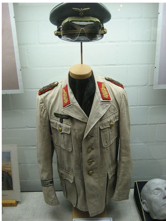
Rommel's Afrika Korps uniform. Note that the color, originally olive, is faded to greenish khaki.

basically the same cut as the standard army uniform but with open collar and lapels, and made of a medium-weight olive-drab cotton twill which in service faded to khaki. Also olive were the shirt and the seldom-worn necktie. Insignia were embroidered in dull blue-grey on tan backing cloth. This tunic was issued to all Army personnel in North Africa, including officers and Panzer crews. Officers as usual often purchased uniforms privately, and olive, khaki or mustard-yellow cotton versions of the M35 officers' tunic were worn alongside the standard issue, sometimes with green collars. The M40 Tropical breeches were of jodhpur type, to be worn with knee-boots or puttees: these were very unpopular and most were soon cut off to make shorts (captured British/Commonwealth shorts were frequently worn as well). By mid-1941 conventional trousers in olive cotton were being issued, followed soon thereafter by regulation Heer shorts; these had a built-in cloth belt. A chocolate brown overcoat in the same pattern as the continental version was issued as protection from the cold desert nights.