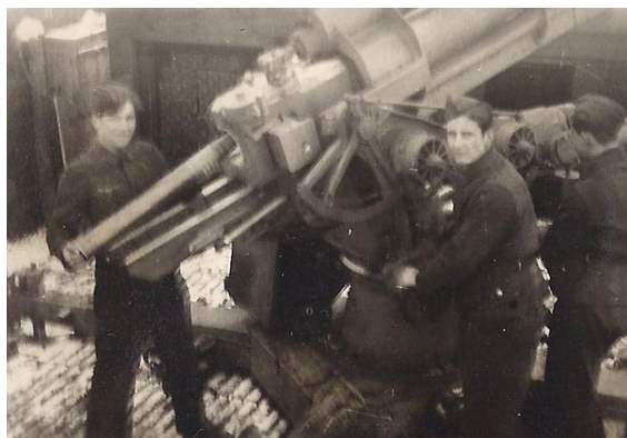
Flakhelfer anti-aircraft gun crew in 1944 pattern uniform

In late 1944, in order to cut down on tailoring and production costs, the Wehrmacht introduced the M44 pattern uniform. Similar in appearance to the British Battle Dress or the related US “Ike” jacket, the M44 was unlike