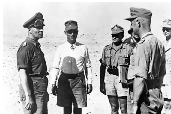
Erwin Rommel and officers, 1942

had been produced. Hooded waterproof parkas were issued later in the war, in white for troops on the eastern