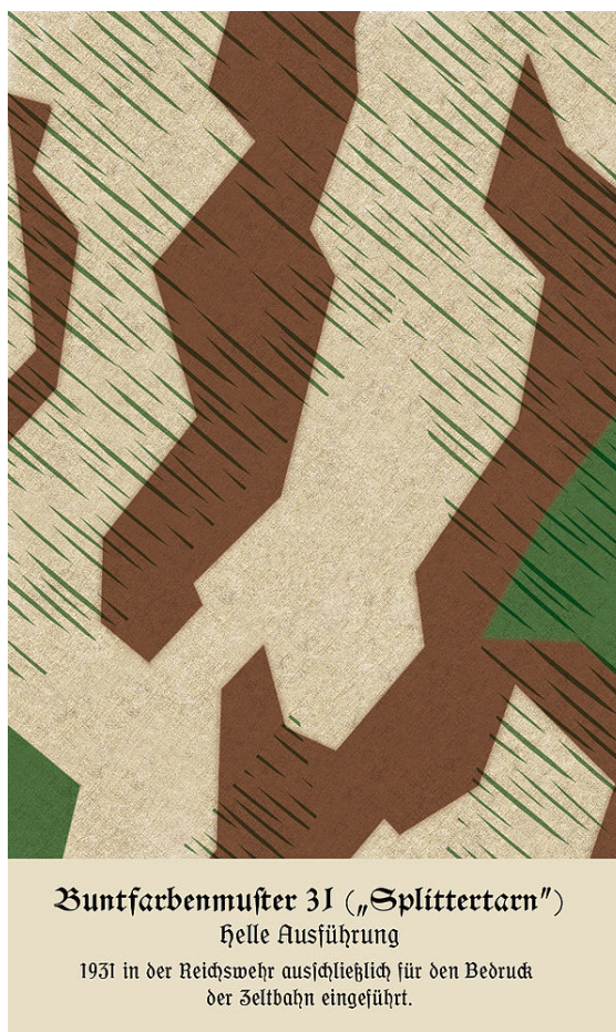
Splittermuster (Splinter pattern)

Main article: German World War II camouflage patterns