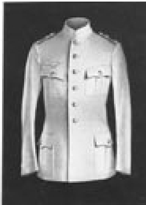
Summer white tunic ( ältere Art )

Production and issue of the Waffenrock was suspended in 1940, and either the service or the officers' ornamental uniform was worn for dress occasions instead. However, the Waffenrock remained authorized for walking out for those who had or could purchase it; and it was a widespread if unauthorized practice to loan a soldier a Waffenrock from regimental stocks to get married in, as evidenced by many wartime wedding photos.